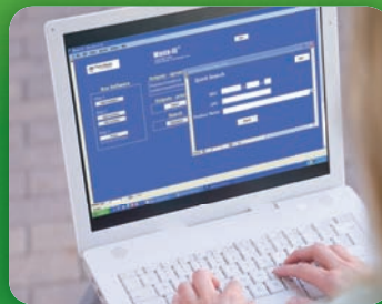
Powerful segregation software