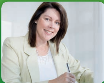
Pharmaceutical waste experts