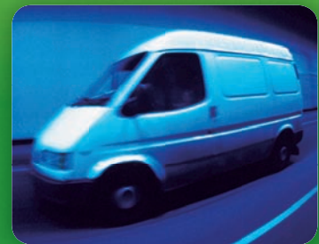
Environmentally responsible disposal