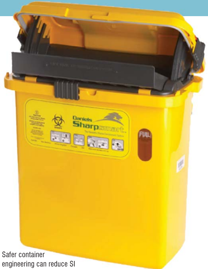
Safer container engineering can reduce SI risk for health-care workers

commonly documented) and many of these (e.g. Ebola, Marburg and malaria) are endemic in South Africa.